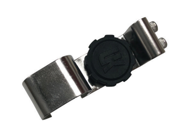
PRODUCT CODE UKT14819 Underwater Kinetics Plastic Brim Clip for torch

PRODUCT CODE UKT14818 Underwater Kinetics Stainless Steel Brim Clip for torch