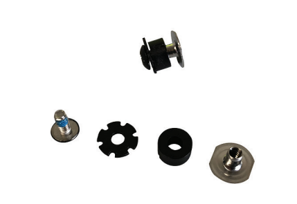
PRODUCT CODE B2138630 Universal Downsize Kit