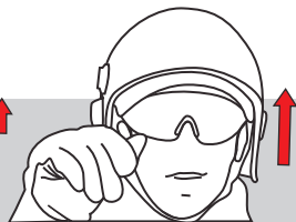
ONE TOUCH™ to stow