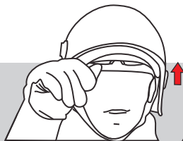
ONE TOUCH™ to deploy