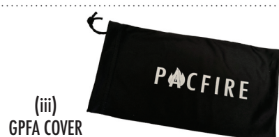
(iii) GPFA COVER