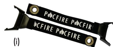
(i) GPFA DS